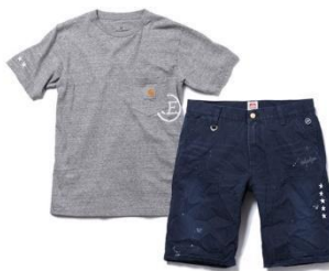
Shorts and T-shirt